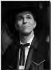
in Ring of Fire

Creative solutions for investment success!