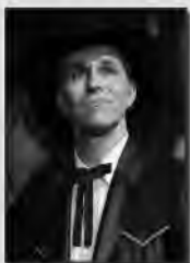
in Ring of Fire

Creative solutions for investment success!